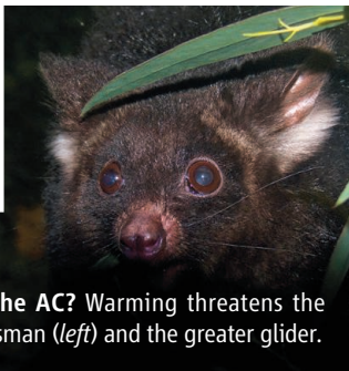
Turn on the AC? Warming threatens the Iberian desman ( left ) and the greater glider.

mate change for species with poor mobility or whose habitat is fragmented. The study “makes a strong case that managed relocation is feasible,” says Sax.